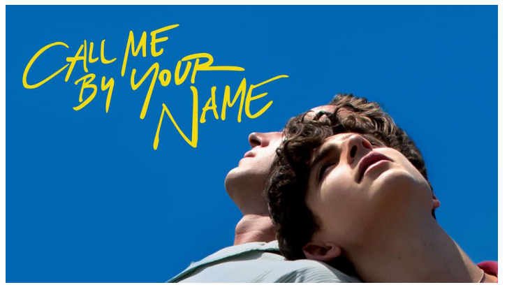
For more information and to register, visit: https://templebethor.com/event/call-me-by-your-name/

The book and movie is a coming-of-age story about a gay, teenage, Jewish boy. You won't want to miss this thought-provoking author interview! We are very excited to bring this accomplished author to the Dayton area (via Zoom), courtesy of our partnership with Anshai Emeth!