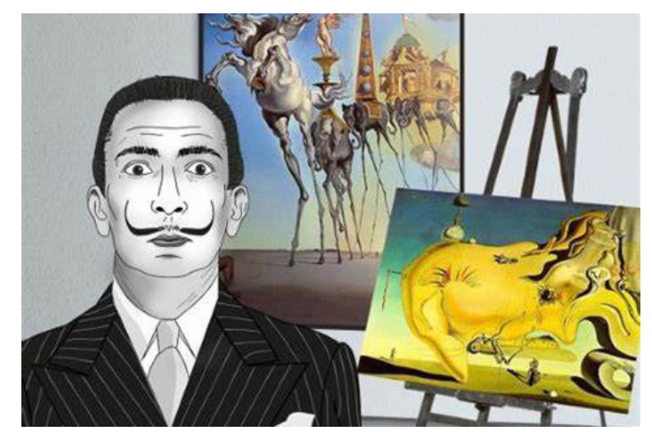
Join us for a night of fun.